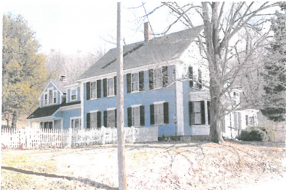
248 Gay Rd