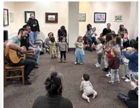
Rockabye Beats Music

"The children's room is fantastic! My daughter loves the weekly crafts and it is so great to have a place to take my tween son. We LOVE the selection of events: kids yoga, Lego, drumming, and robots—there really is something for everyone!"