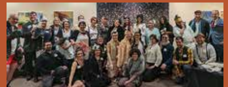
Murder Mystery Night