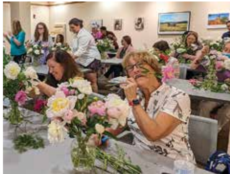
Peony Flower Arranging

Participants unleashed their inner artists in local art classes and immersed themselves in the collections with the curators of the Asian Art Museum.