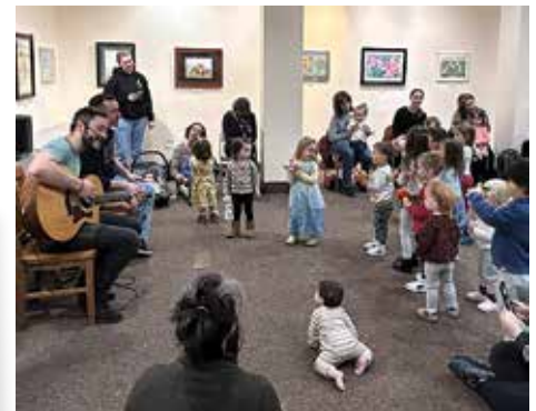
Rockabye Beats Music.

"The children's room is fantastic! My daughter loves the weekly crafts and it is so great to have a place to take my tween son. We LOVE the selection of events: kids yoga, Lego, drumming, and robots—there really is something for everyone!"