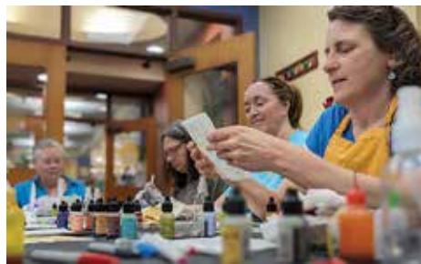
Alcohol Ink Workshop