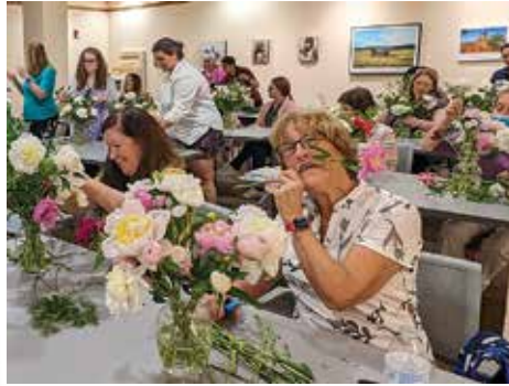
Peony Flower Arranging.

Participants unleashed their inner artists in local art classes and immersed themselves in the collections with the curators of the Asian Art Museum.