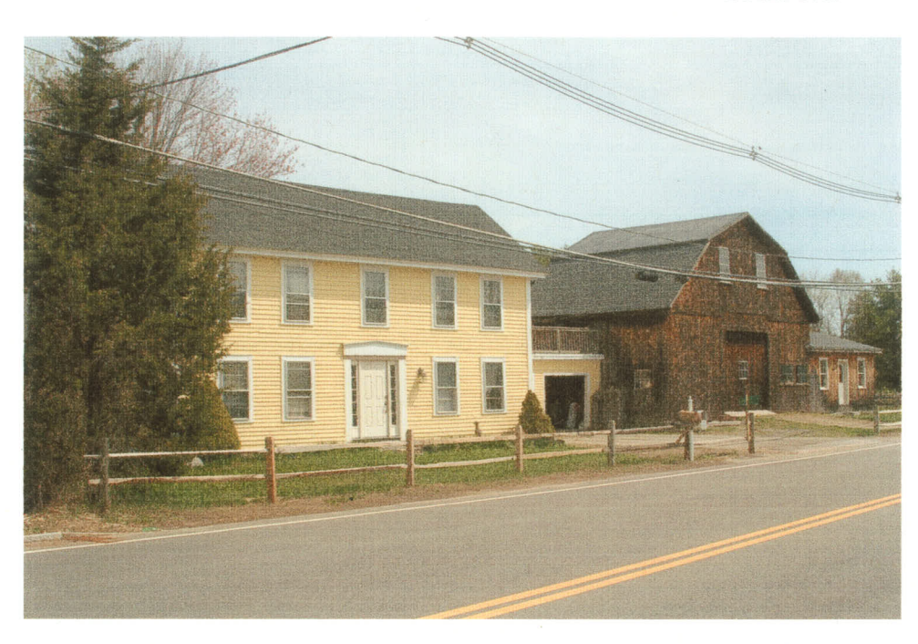
15 Forge Village Road