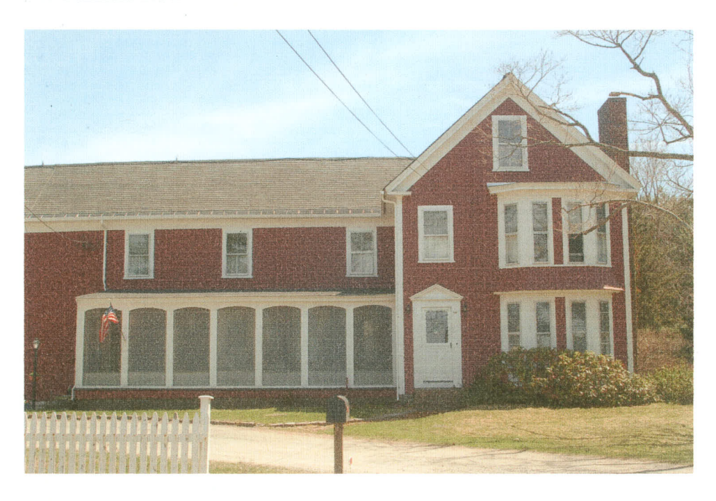
545 Farmers Row