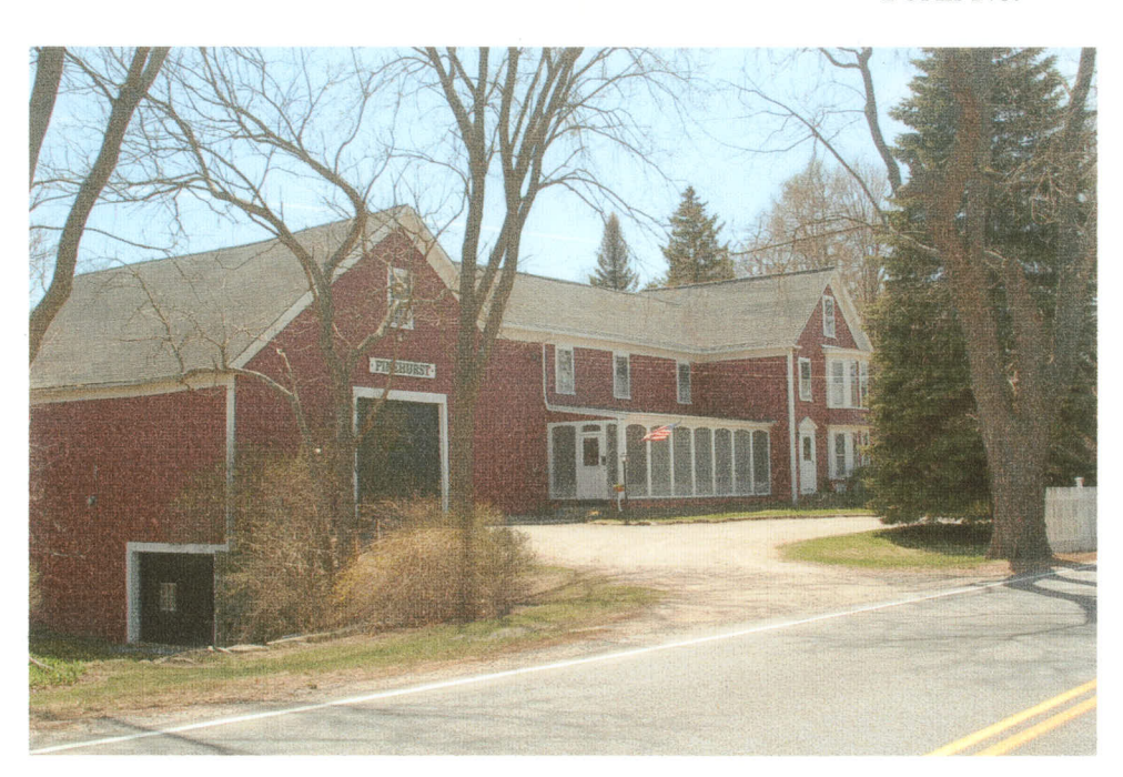
545 Farmers Row