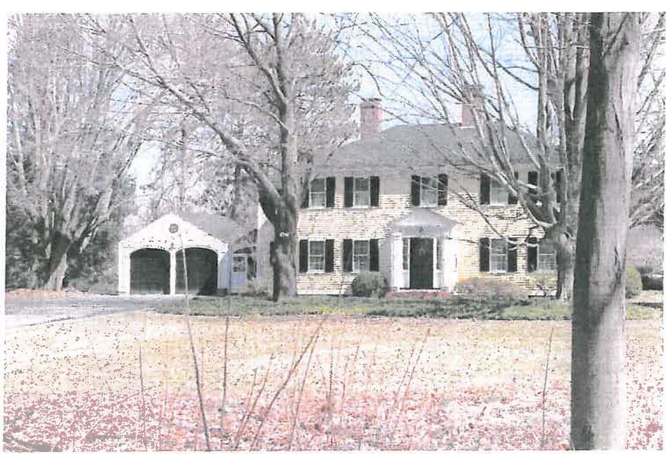
237 Farmers Row, Groton School