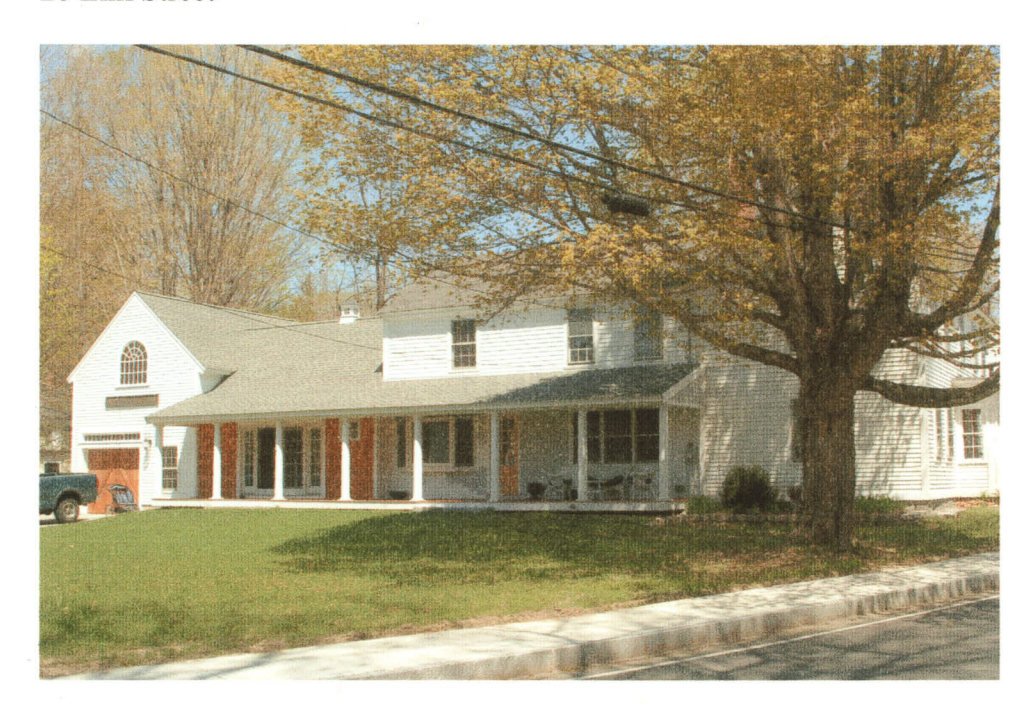
28 Elm Street