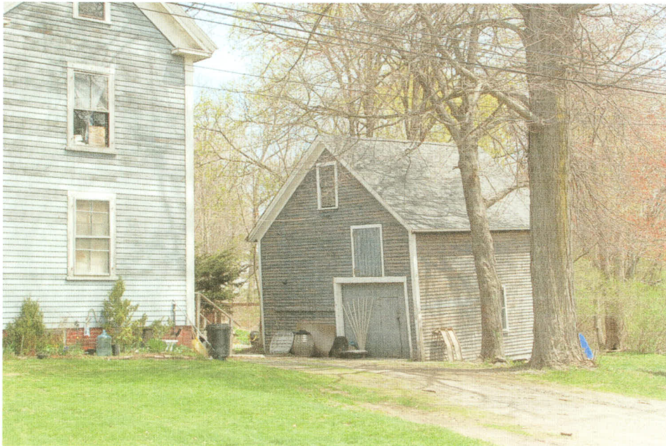
31 Court Street