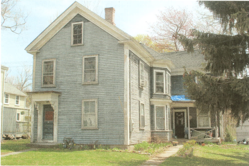
31 Court Street