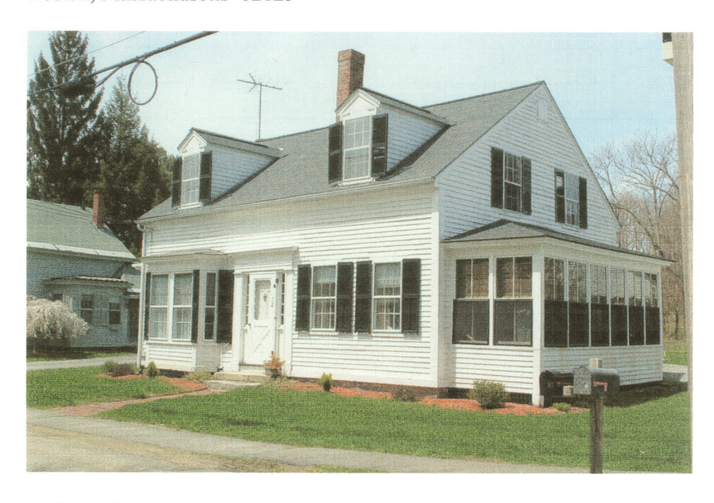
12 Court Street