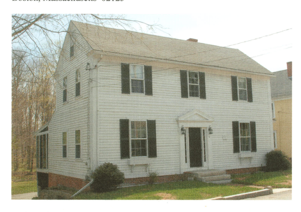
11 Court Street