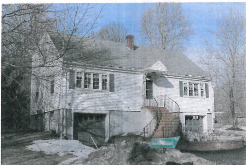
14 Main Street, Holy Union School, Bethany House