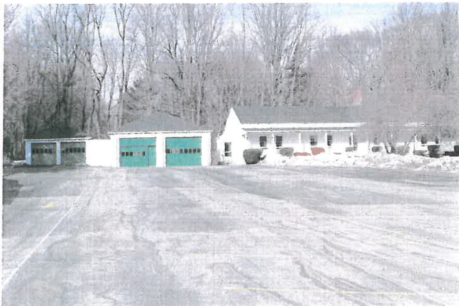
14 Main Street, Holy Union School, garage, modern building