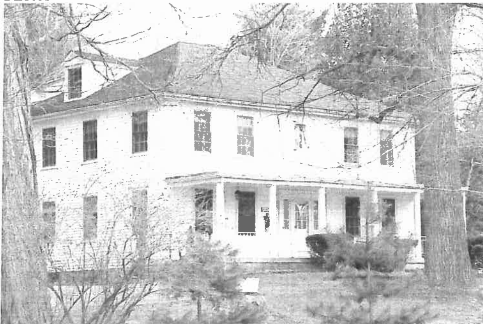
14 Main Street, Prescott House