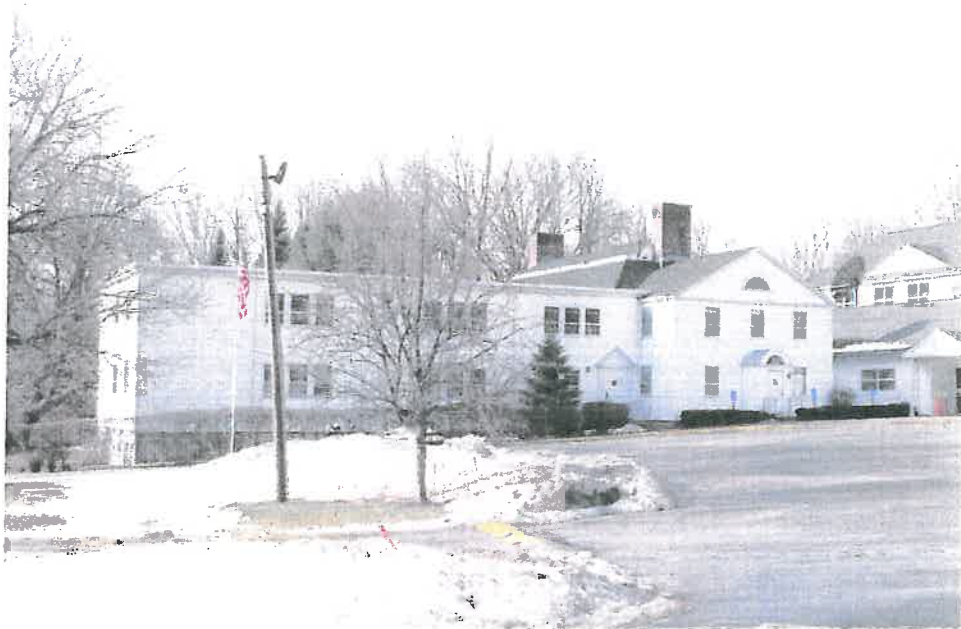
14 Main Street, Holy Union School Building, east elevation