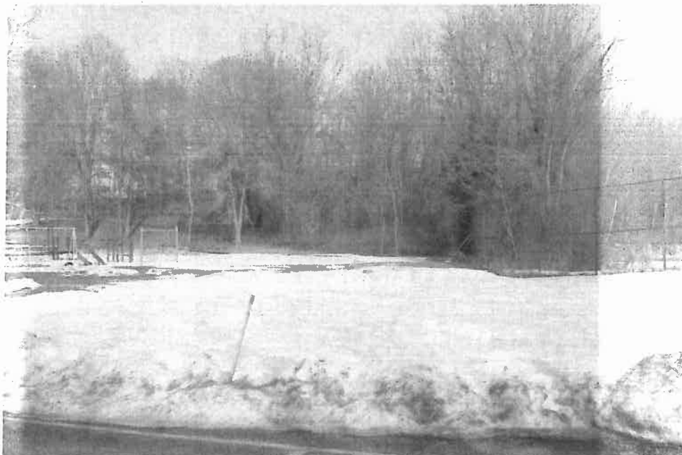
14 Main Street, Holy Union School, playground