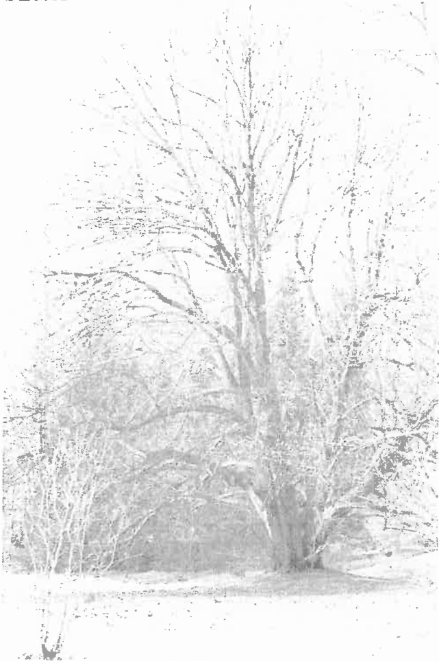
14 Main Street, Holy Union School, ornamental planting