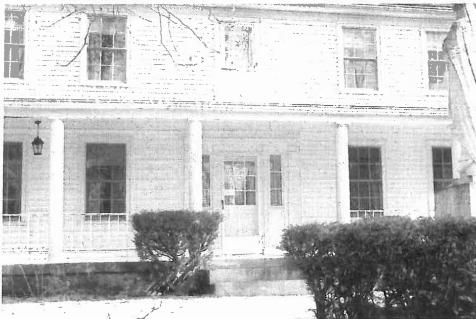
14 Main Street, Prescott House entry detail