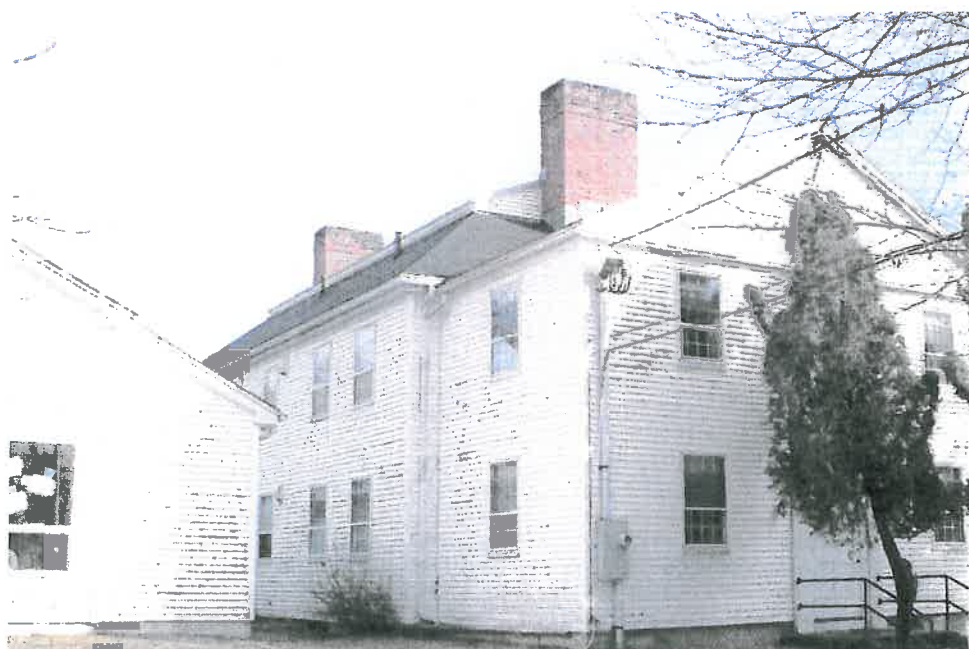
14 Main Street, Holy Union School Building, west elevation