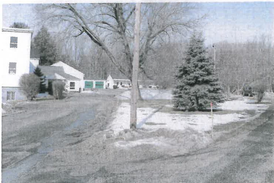
14 Main Street, Holy Union School, entrance