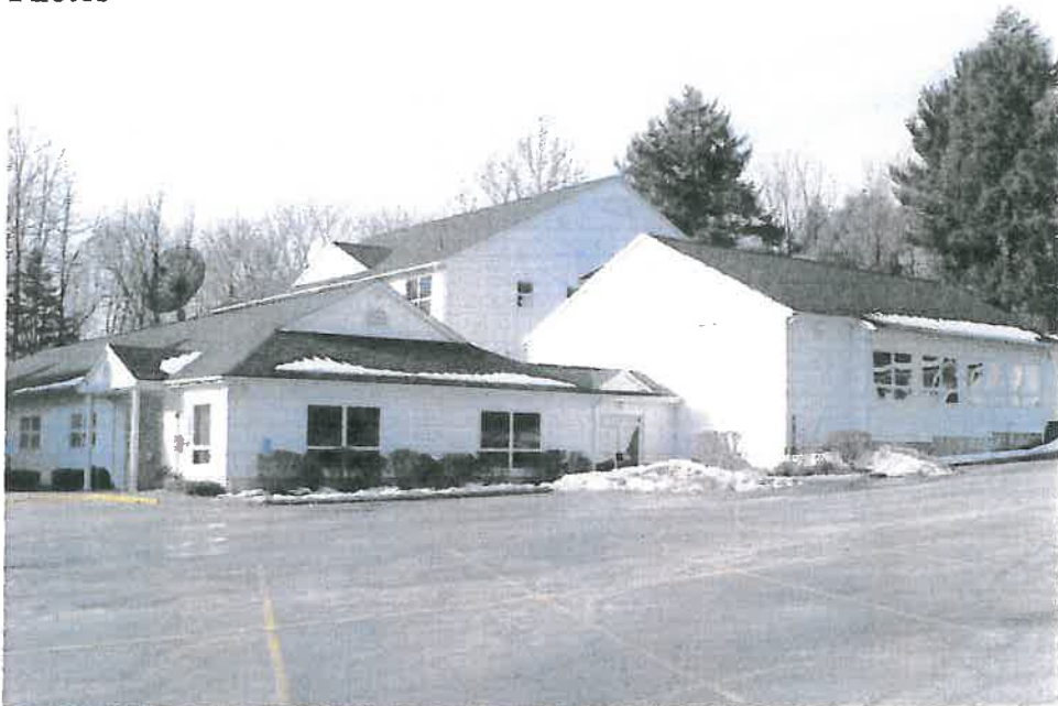
14 Main Street, Holy Union School, modern buildings