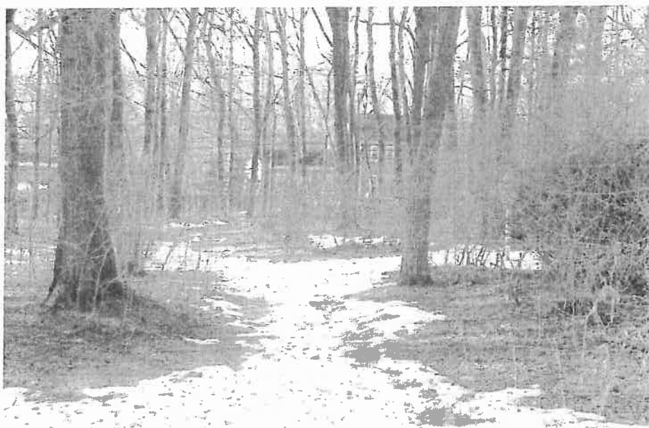
14 Main Street, Holy Union School, circulation network