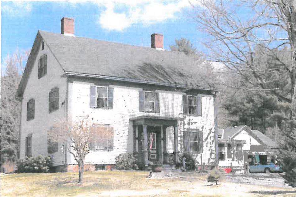
162 Common St