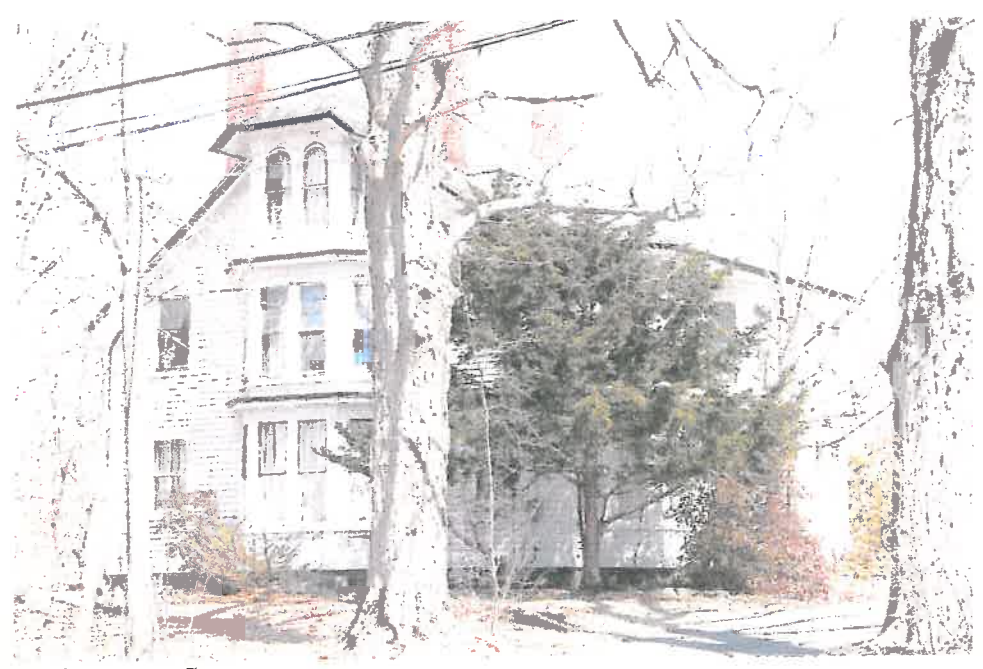
22 Common St