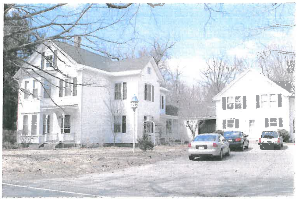
69 Champney St