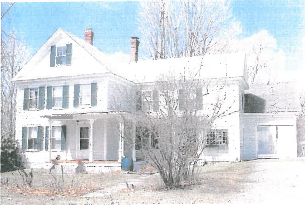
59 Champney St