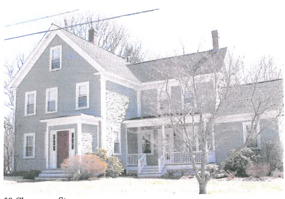
58 Champney St