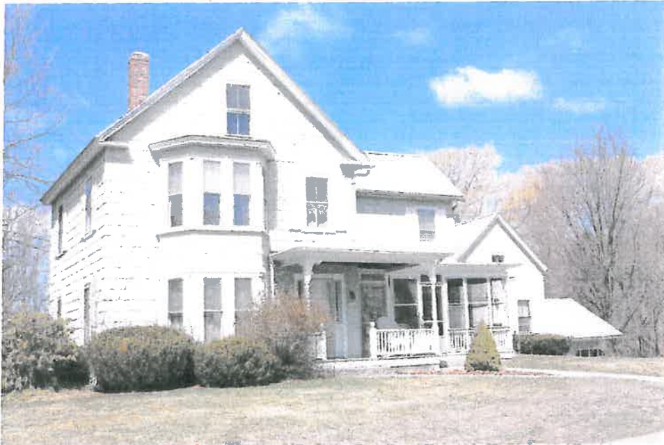
47 Champney St