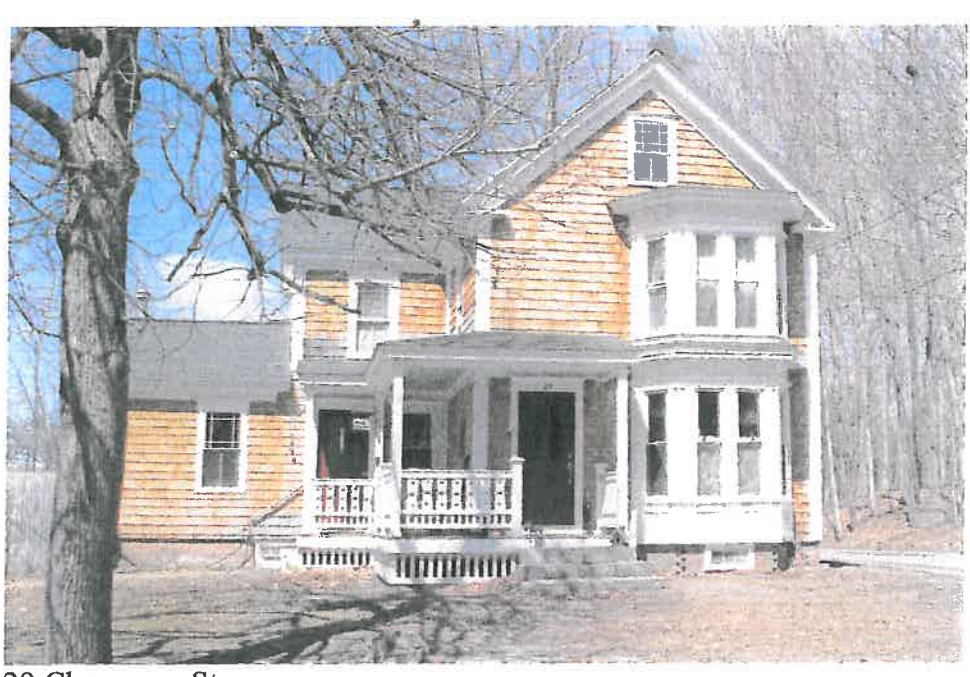
29 Champney St