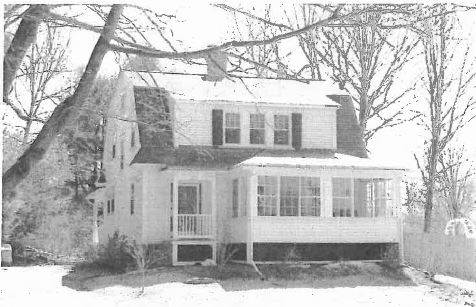
22 Champney St