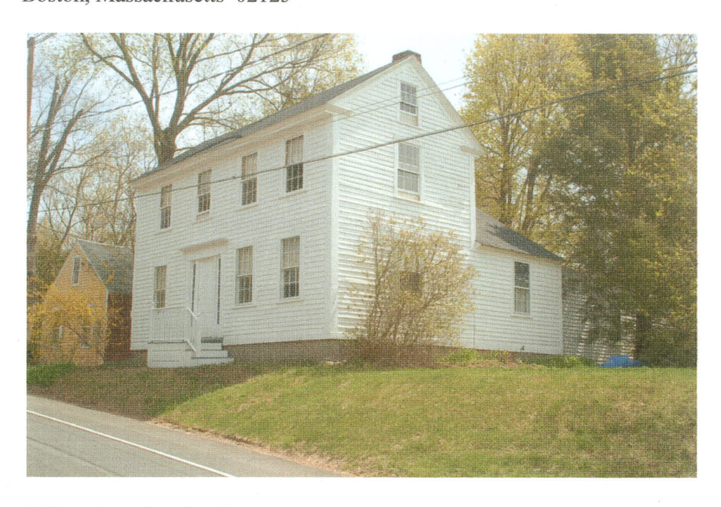
17 Broadmeadow Road