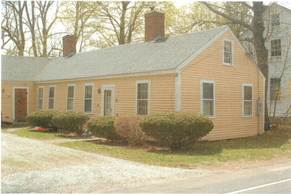
13 Broadmeadow Road