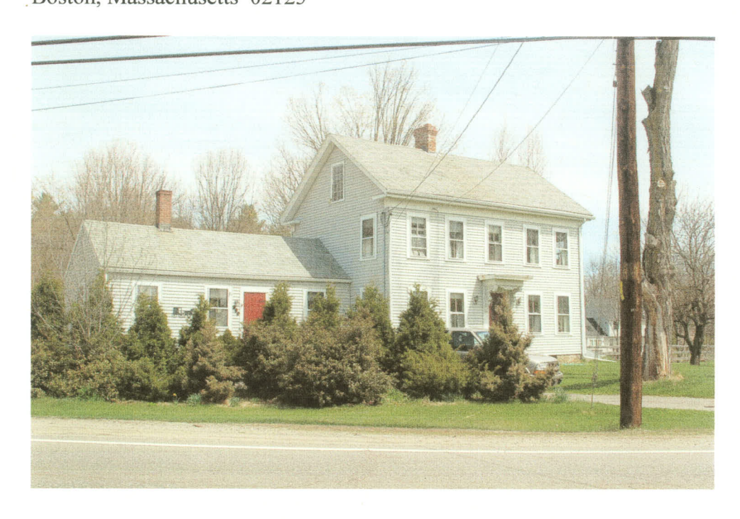
399 Boston Road