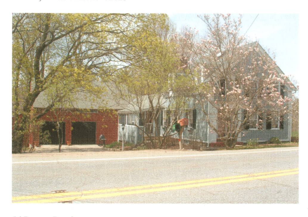
56 Boston Road