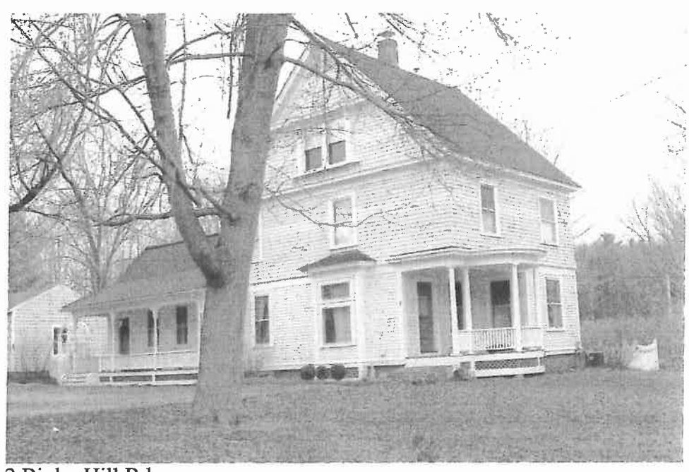
2 Bixby Hill Rd