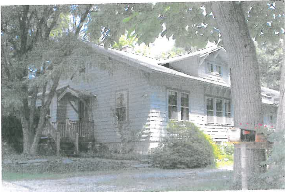
17 Adams Avenue