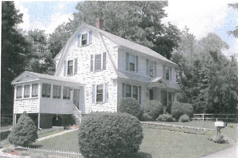
14 Adams Avenue