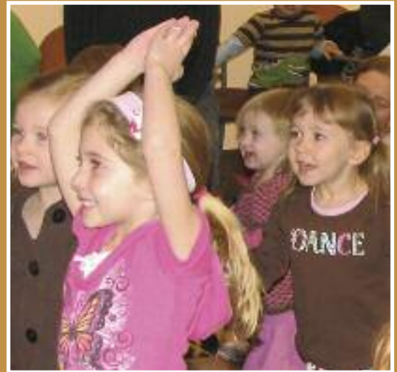
Preschoolers delight in the Tales for Tunes program.

buzzing with inquisitive students was a common one because of the Endowment's grant which supports transportation for elementary school students to visit the GPL.