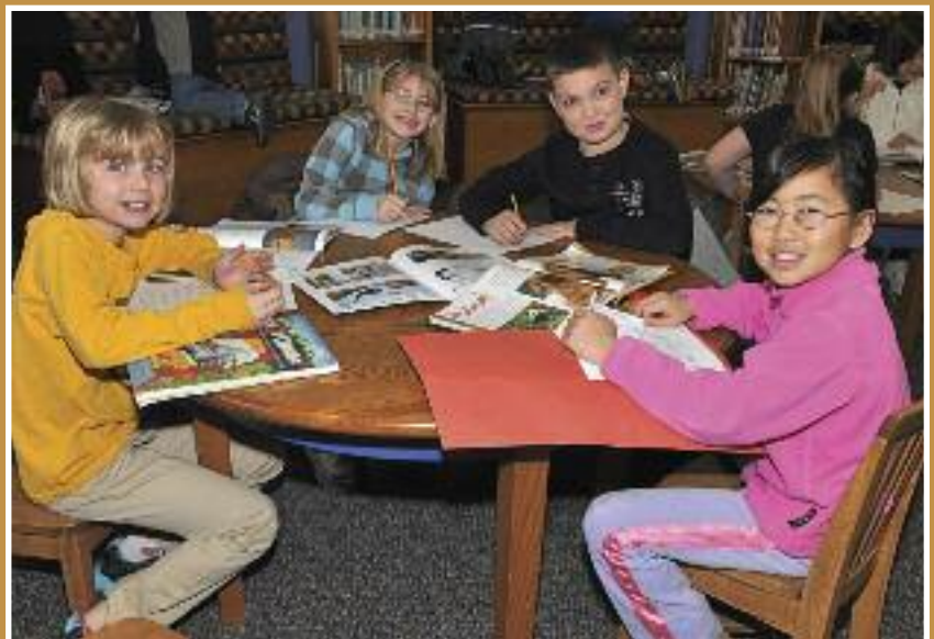
Second-graders are excited to work on a school project at the GPL.

"I can read! I can read!" Beginner reader books are a great resource for parents whose children are taking their first steps toward reading. Because of the increased demand for beginning readers, we asked the Endowment to fund more phonics books as well as first readers. These books give the emergent reader the ability to gain the skill and confidence to become life-long readers. Check them out for your soon to be reader.